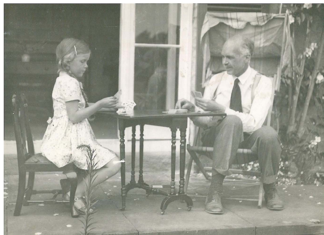
Figure 1 Together with my father in 1943.

Dad brought with him to England some lifelong hobbies from Australia. His interest in natural history was one,